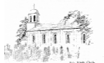
Drawing by Larry Carr

There are four main religious groups, The Methodist Church dating back to the 1860's, the Church of England Holy Trinity Church, The Holy Family Catholic Church on the Freckleton/Warton boundary serving both Freckleton and Warton, and the South Fylde Community Church which meets in the Village Hall.