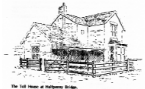
The Toll House at Halfpenny Bridge.