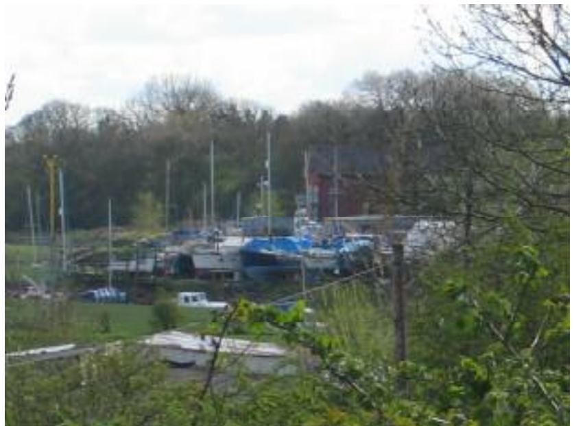
Freckleton Boat yard