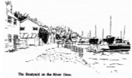
Drawing by Larry Carr

Up until the Second World War, the main industries were agriculture, weaving, (Balderstone Mill), rope making and shipbuilding. During the Second World War, our American allies established the BAD 2 airfield, which is now BAe Systems. Following the war, the population of Freckleton increased rapidly; with new housing estates being built on the disused service quarters (Brownfield sites) such that the population increased to 6045 people as indicated by the 2001 census. Today Freckleton is the largest village in the Fylde.