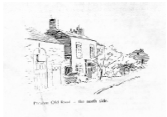
Freckleton Old Road - the north side.