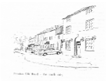
Freckleton Old Road - the south side.

To consider refurbishing the existing facility, with provision for disabled and baby changing room, or to consider a new facility, either on the present site or elsewhere.