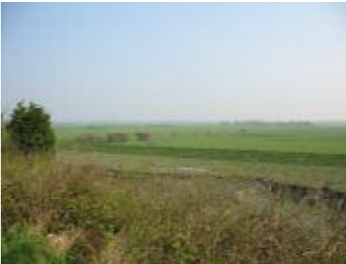
Freckleton Marsh – Freckleton pool in the foreground

After all, the future of the Parish of Freckleton will depend on what they can offer in terms of employment, and this in turn will dictate the quality of life for the residents of Freckleton.