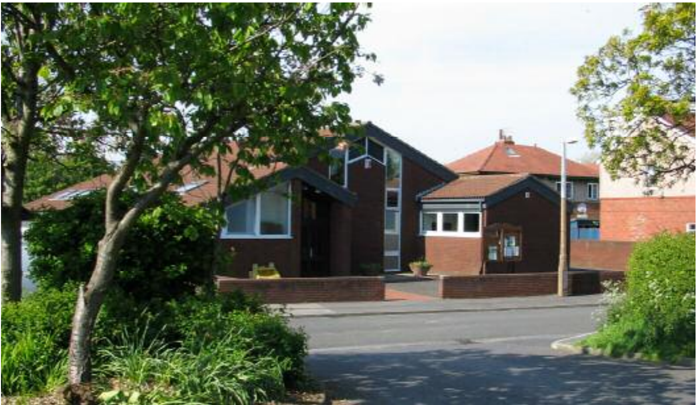
Freckleton Village Memorial Hall